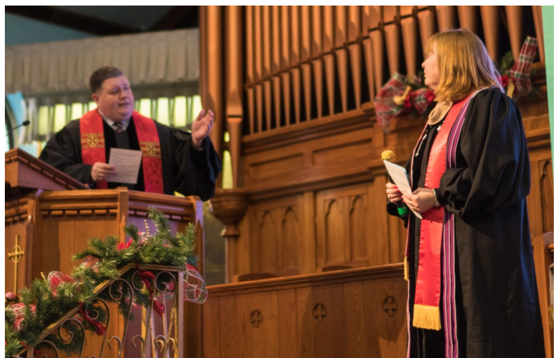
Charge to the Pastor