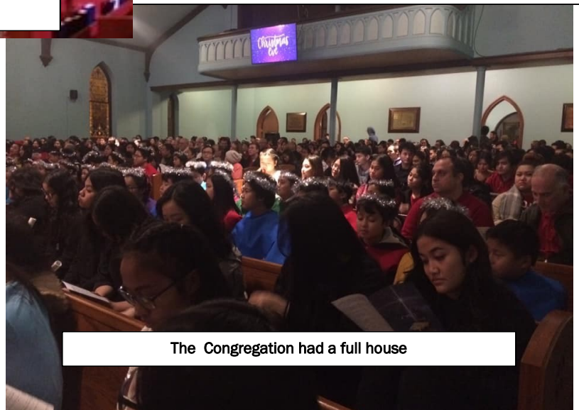
The Congregation had a full house