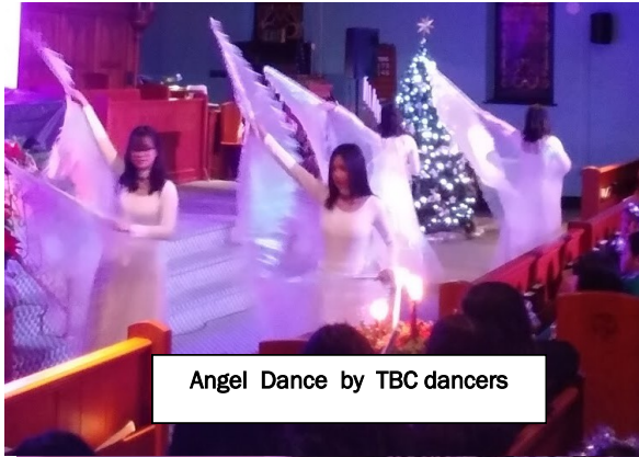
Angel Dance by TBC dancers