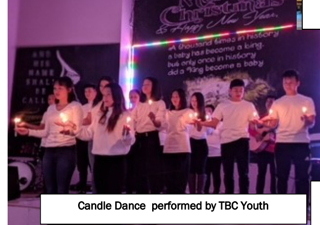
Candle Dance performed by TBC Youth