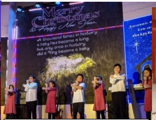
Karen School Children performance