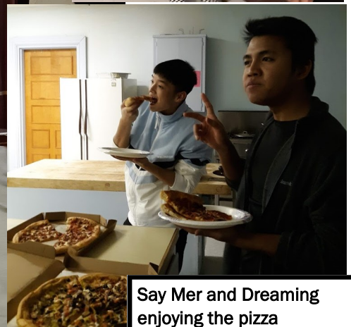
Say Mer and Dreaming enjoying the pizza