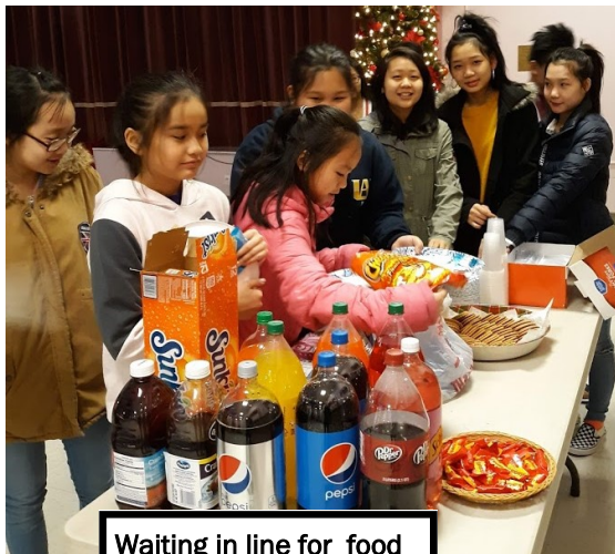
Waiting in line for food