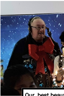
Our best beautiful Christmas Trees