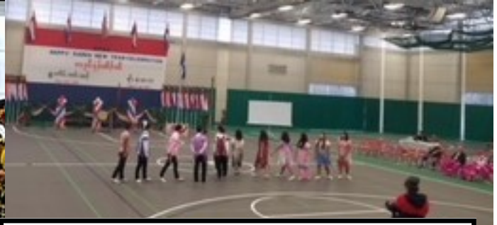
Karen Rope Dance was performed by our TBC Youth