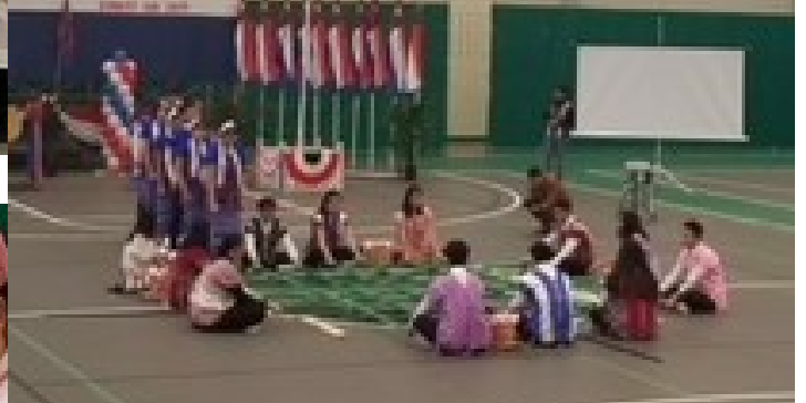
Karen Bamboo Dance was also performed by our TBC Youth