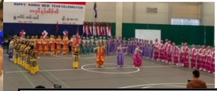
This year more than three traditional Karen Don dances were performed. Our neighbor Syracuse and Albany also participated in Utica Karen New Year.