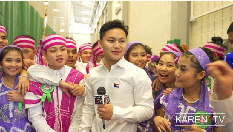
Every year Karen Entertainment TV interviews people that have attended the Karen New Year celebration. If you would like to know more about the interview, please check out their channel in YouTube.