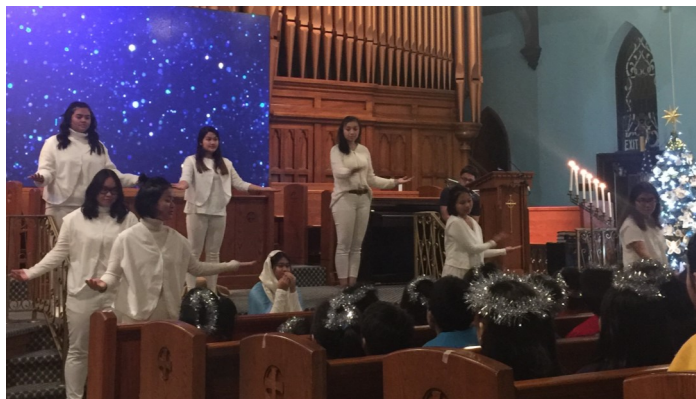
TBC Stick Team