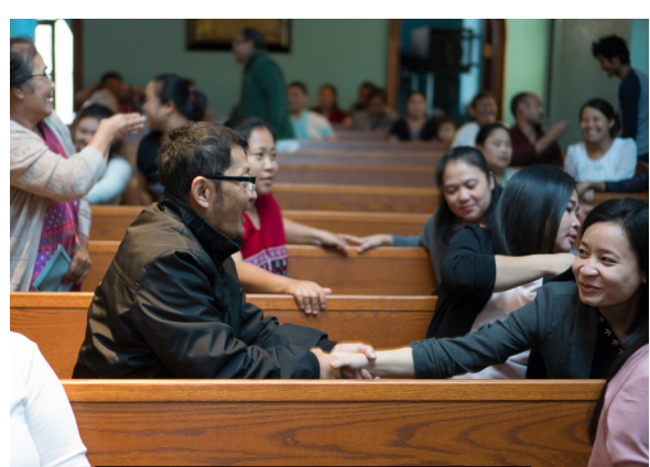
Passing the Peace of Christ