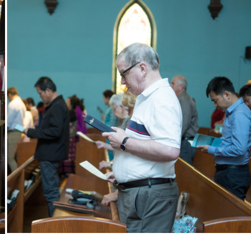
Reciting the Litany